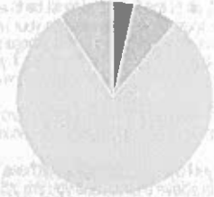
Total Rewards earned 2023