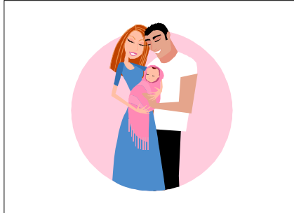
Ransom Canyon Demographics are changing to Young Professional Families.

Ransom Canyon is larger than Ralls, Lakeridge, O'Donnell or Sudan.